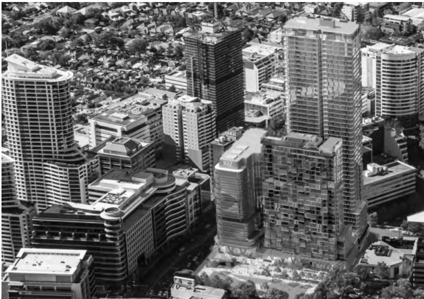
JQZ development and more height is proposed

The two St Leonards Square towers are complete, the Landmark development next door is rising to its 43 storey height and the three JQZ towers (16, 28 and 49 storeys) will soon emerge from St Leonards Station.