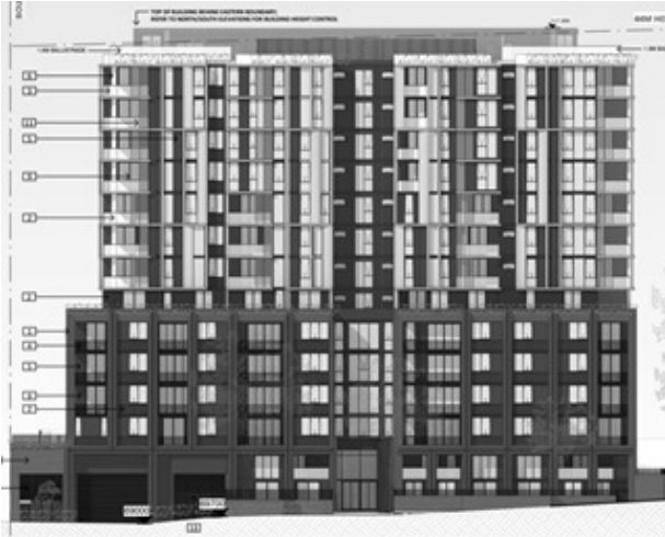
3 Holdsworth Avenue