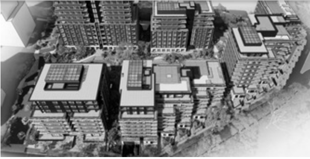
21-41 Canberra Avenue & 18-32 Holdsworth Avenue