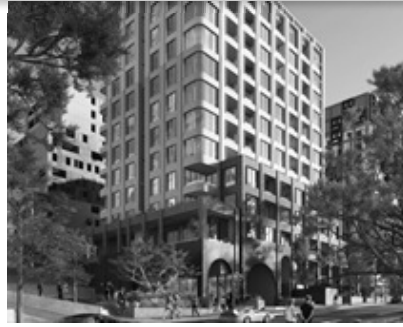
13-19 Canberra Ave