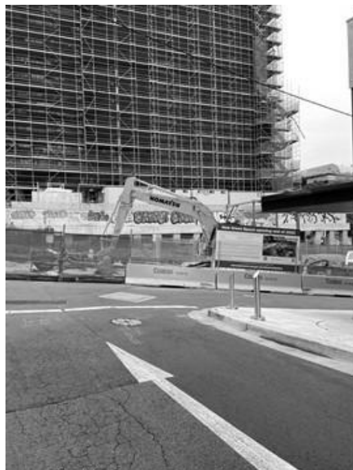
Closure top Canberra Avenue for plaza