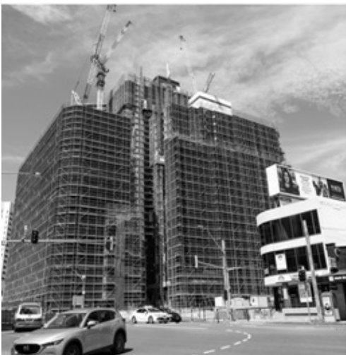
JQZ under construction construction

Residents in Marshall Avenue and Duntroon Avenue are already experiencing significant problems with the plaza works, with trucks being forced to reverse down one-way streets for the next year and pedestrians having to run the gauntlet of trucks on Marshall Avenue.