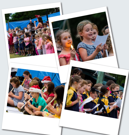
Lots of kids having lots of fun at the Greenwich Carols by Candlelight