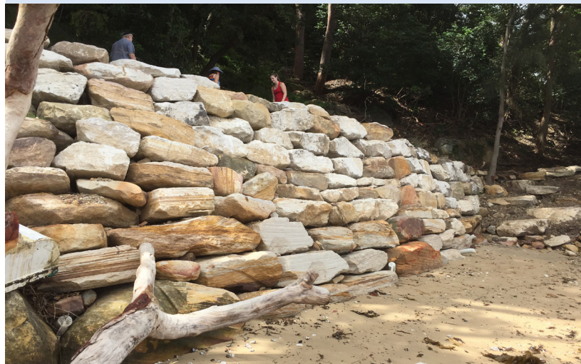
The impressive retaining wall now makes it safer to walk along the bush track

We note and appreciate two recent repairs to community facilities. The first was upgrading the rough track from Gother Ave to East St to make it easier for prams, wheelchairs and pedestrians. The second was completion of the first phase in the construction of a major retaining wall along a section of the bush track from the ferry wharf to Shell Park which had been subject to dangerous subsidence.